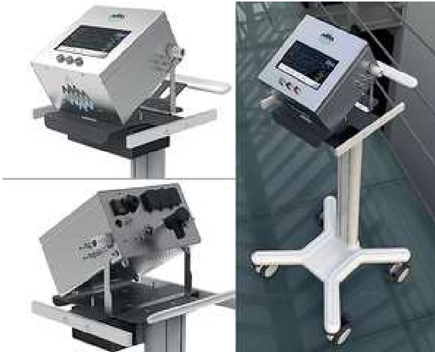
The Mechanical Ventilator Milano unit

International MVM Group originated through an international consortium of Italian, U.S. and Canadian physicists, engineers and companies in early March, 2020, working collaboratively across the globe to bring the MVM Ventilator from project initiation to FDA approval in a span of six weeks. Achieving this result in such a short time was made possible thanks to the cooperation of laboratories, institutes, universities and companies mainly across Italy, Canada and the United States, maximizing the benefits that come from sharing skills and resources.